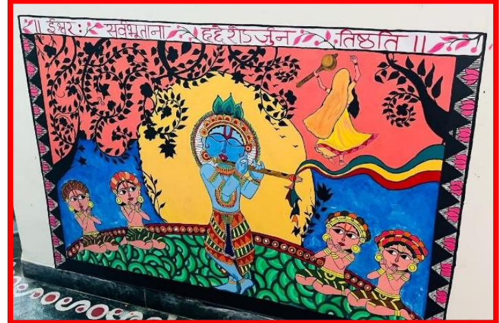
Students Displayed Vibrant and Traditional Madhubani Paintings on Walls