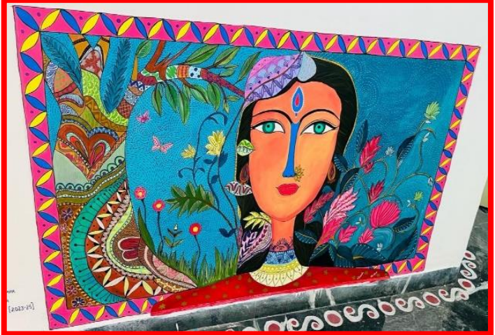
Beatiful Art work displayed by the students during Wall Painting Competition